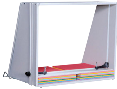
J1824 Jiffy Giant