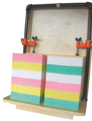
W175 Ultra II