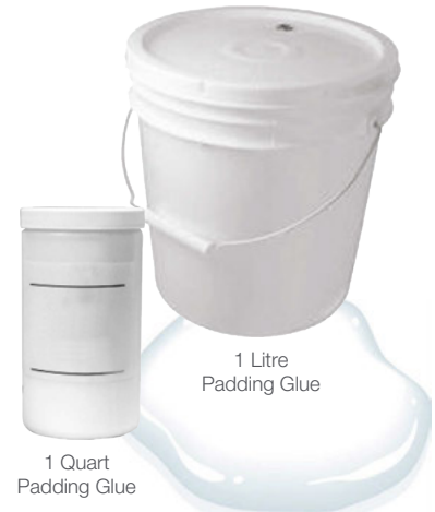
1 Quart Padding Glue