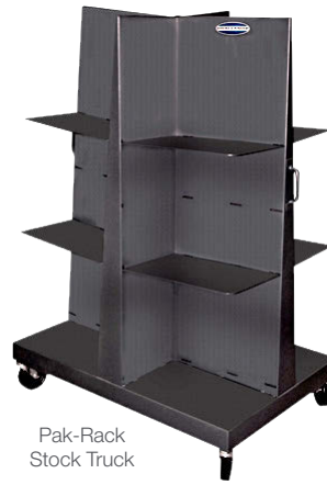
Pak-Rack Stock Truck