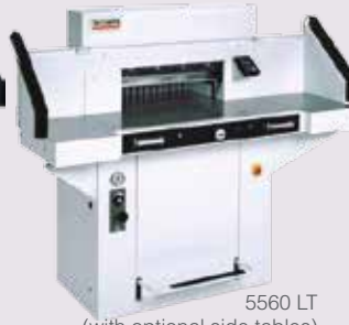
5560 LT (with optional side tables)

VRCUT CUT WITH CONFIDENCE by LYTROD SOFTWARE