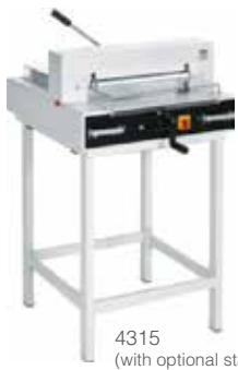
4315 (with optional stand)