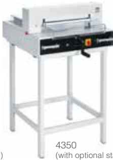
4350 (with optional stand)