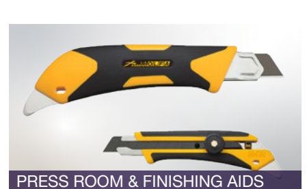
PRESS ROOM & FINISHING AIDS