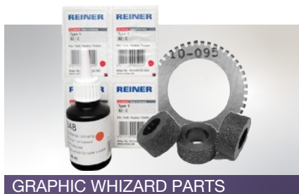
GRAPHIC WHIZARD PARTS