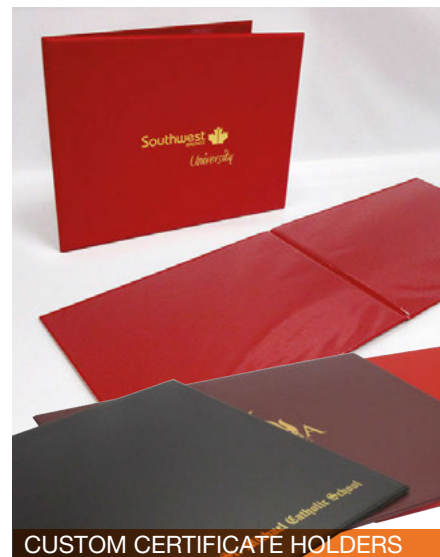
CUSTOM CERTIFICATE HOLDERS