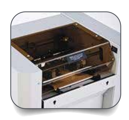
Safety Access Cover

The MBM Sprint 5000 jogs staples and folds in one simple operation. The Sprint 5000 is easy to set up and can be used in conjunction with the FC 10 collator and face trimmer. This unit has variable speeds and producing booklets up to 88 pages thick and 1,500 booklets/hr, all with quick and easy setups.