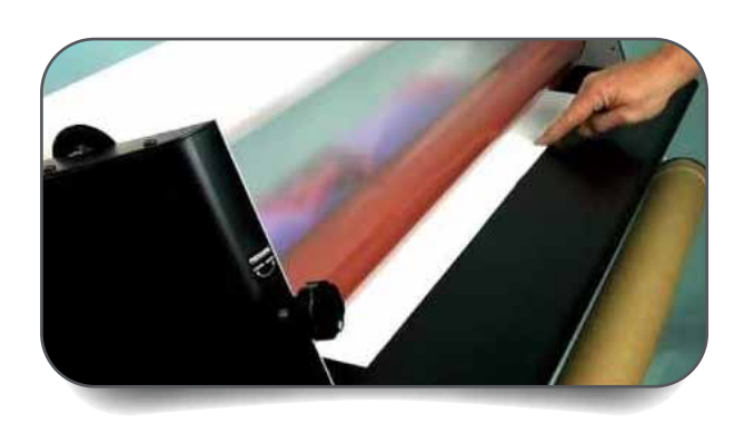
Mounting Prints to Boards

The Solo 55" cold laminator is so easy to use, it becomes a one person finishing system. It costs thousands of dollars less than other laminators on the market. It provides you with the essential features found on more expensive models which include: Top and bottom nip rollers covered with hard silicone, Automatic take up shaft and can Accommodates boards up to 1/2" thick (can be made for 1" thick boards upon request).