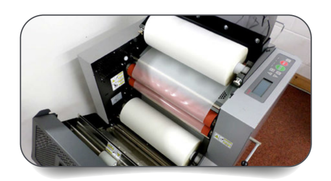
Improved film roll installation

The newest, commercial-grade Fujipla laminator by Dry-Lam has everything you know and love about the previous ALM line for automatic feeding, laminating, trimming, and stacking sheets, but is now faster and better with improved features and functionality! Laminating up to 68" per minute, it is 25% faster than the ALM3230.