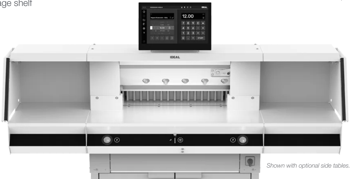
Shown with optional side tables.