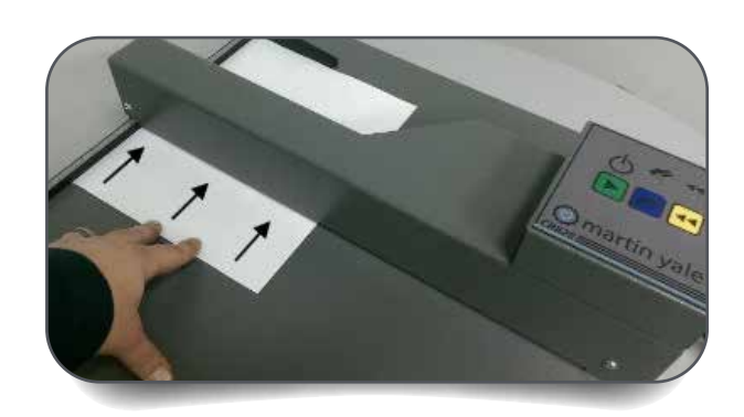
Aluminum Paper Guides

The Martin Yale CR828 Creaser has a maximum creasing width of 18". Bar & channel gives a straight and consistent crease across the full length of the sheet. Aligning your sheets are made easy with the moveable twin stoppers.