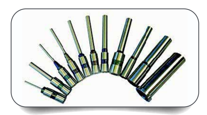
Adjustable Head Design

The Spinnit FM-2 is an economical heavy duty floor standing paper drill that is designed to drill one hole at a time in a stack of paper up to 2" thick. This paper drill is an excellent choice for organizations that need to drill custom hole patterns. It offers incredible flexibility and ease of use. The FM-2 features a manual foot pedal operation that gives you full control over the drilling speed of the unit. The E-Z Glide table system uses pattern bars which allow for quick movement from hole to hole for multi-hole drilling.